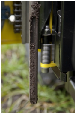
The probe is easily replaced, even in the field. Just loosen the lock nut, and mount the new probe.