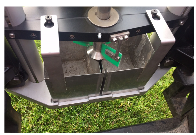
Soil from different layers is automatically filled into the soil boxes. Dividing the samples is conducted with close accuracy.

All actions can be carried out from the control system. Pre-settings like the depth, sticks and layers per sample as well as choosing the soil box can quickly and easily be entered into the the control system.