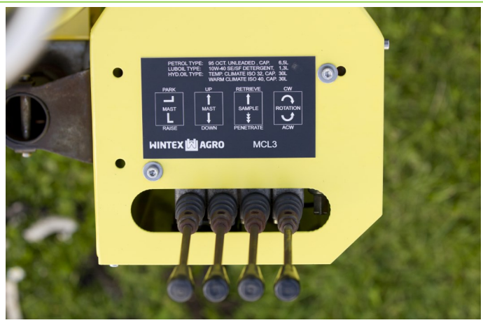
Operating the soil sampler happens by activating the functions of the control panel.