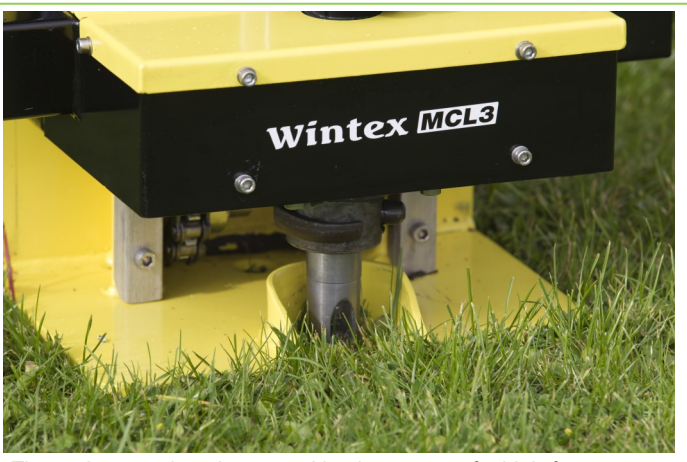
The probe goes into the ground by the means of a high-frequency hammer.