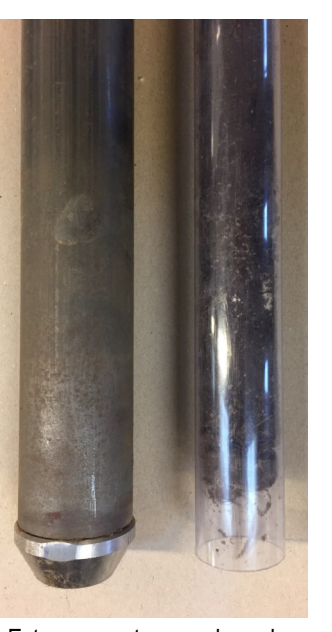
Extras: a custom-made probe with an integrated plastic liner makes it possible to extract and keep a whole core of soil.